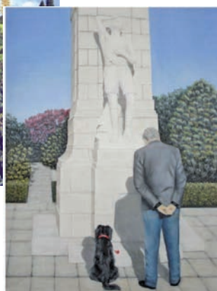
"Lest we forget"