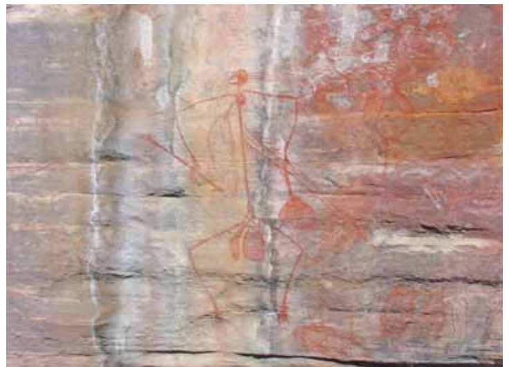
Well hung art.

For more information see: www.aboriginal-art-australia.com